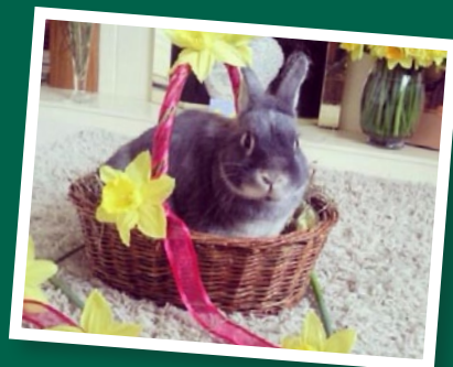
Our winner of our Protexin Equine Premium Easter competition, Blueberry Muffin