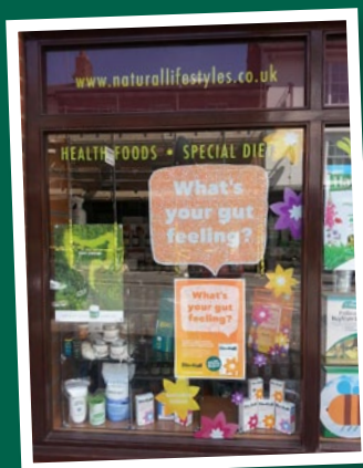
We love this Bio-Kult window display!