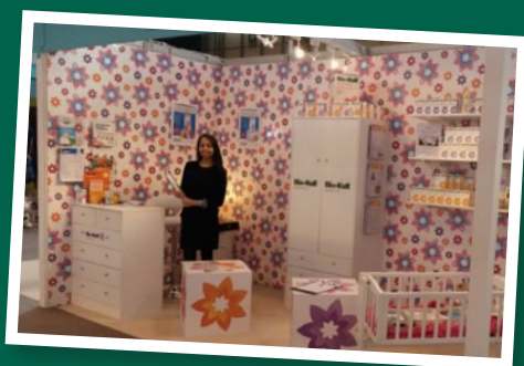
Our Bio-Kult stand at The Baby Show