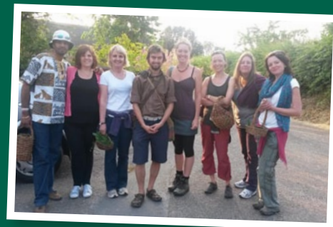
Team Bio-Kult were treated to a foraging session by a local expert