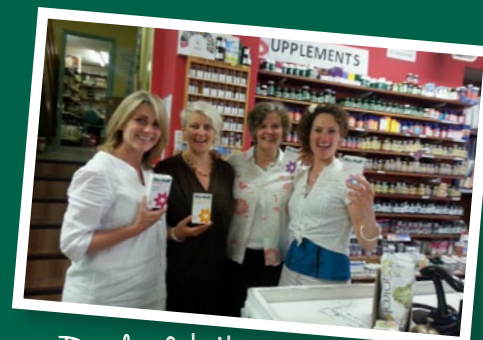
Retailer of the Year winners Archie Browns looking very pleased with their Bio-Kult prize